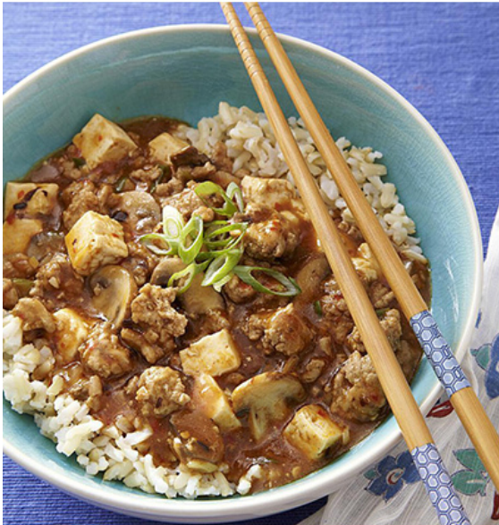
Turkey Ma Po Tofu