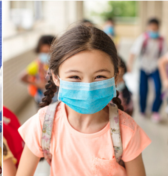
Back to School Reminders & Readiness