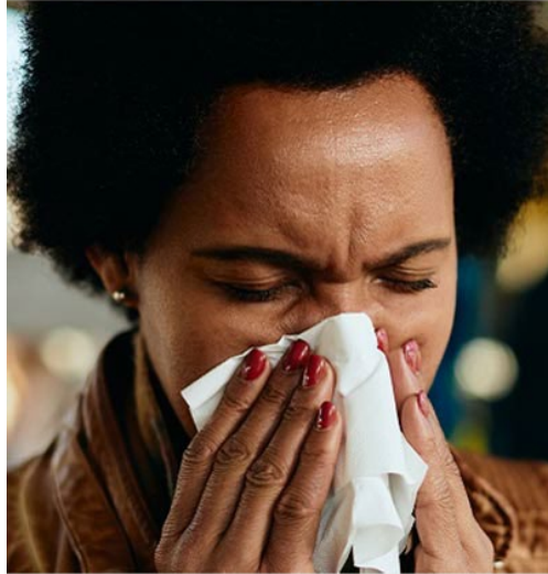
Prevent Seasonal Flu