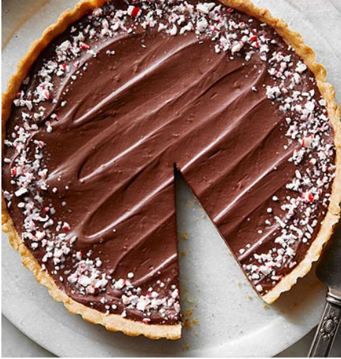
Peppermint Chocolate Tart