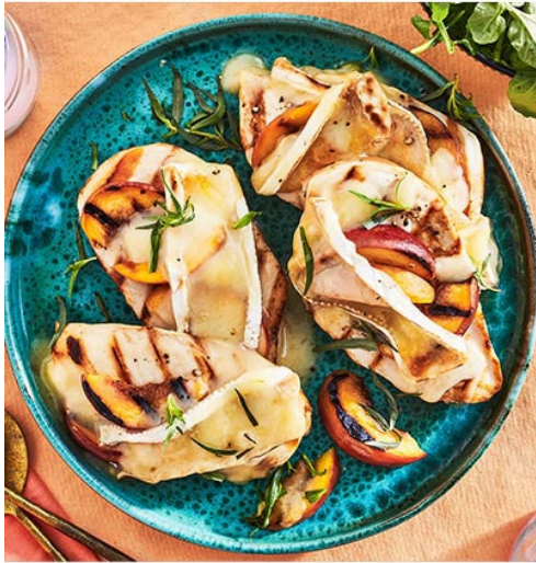
Grilled Peach & Brie Smothered Chicken