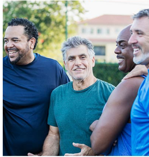
National Men's Health Month