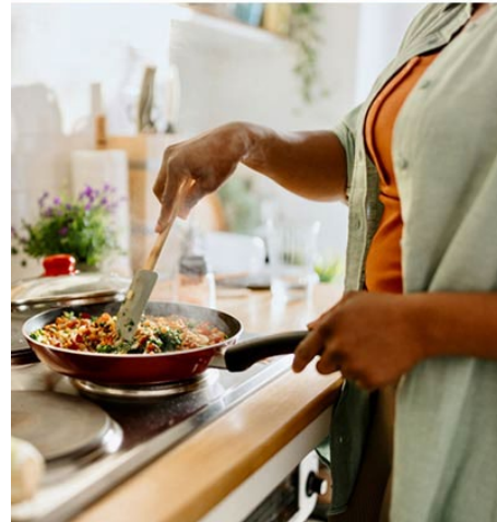
National Nutrition Month