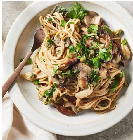
Mushroom Piccata Pasta