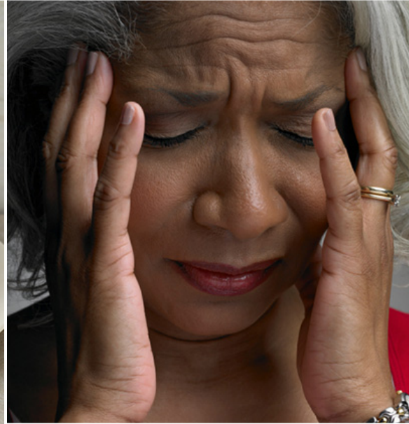
Signs and Symptoms of a Stroke