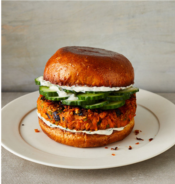
Sweet Potato Black Bean Burgers