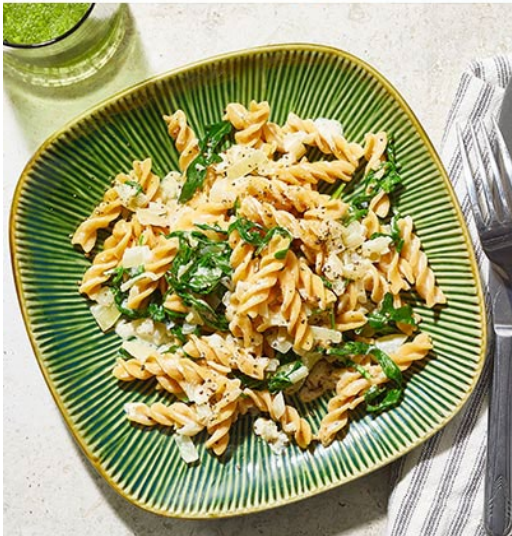
French Onion Dip Pasta with Arugula