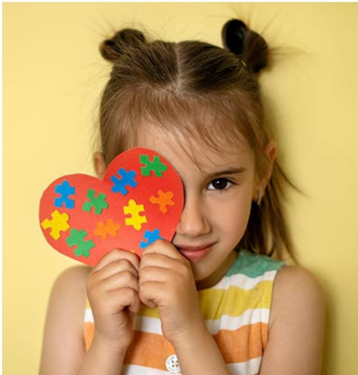
National Autism Awareness Month