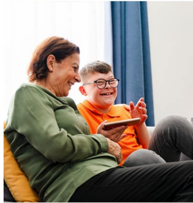
Autism Awareness Month