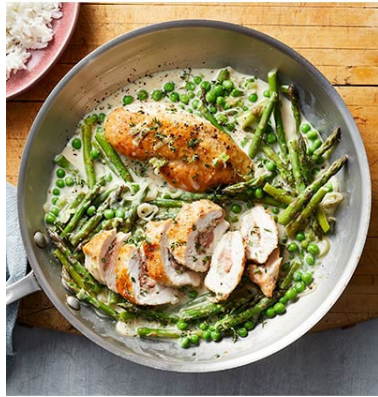
Fontina & Prosciutto Stuffed Chicken with Spring Veggies