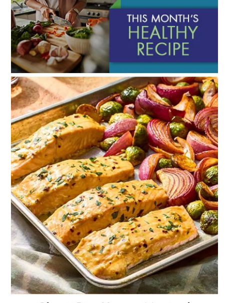
Sheet-Pan Honey Mustard Salmon & Vegetables