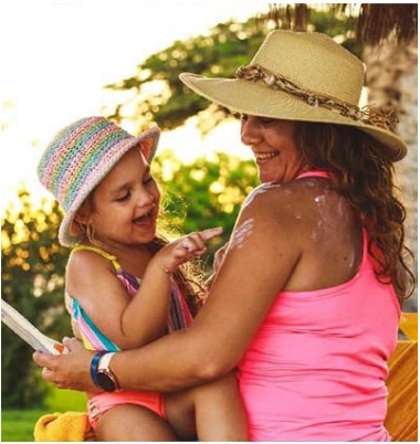
Practice Sun Safety!