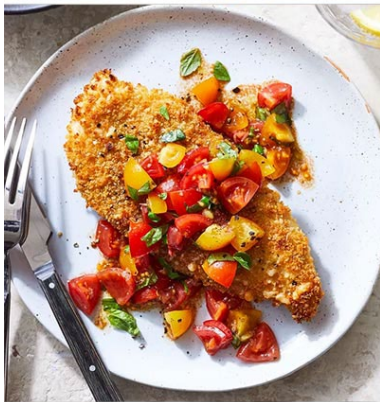
Bruschetta-Topped Crispy Baked Chicken