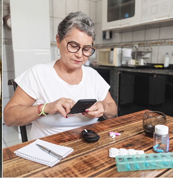
Diabetes Resource Center