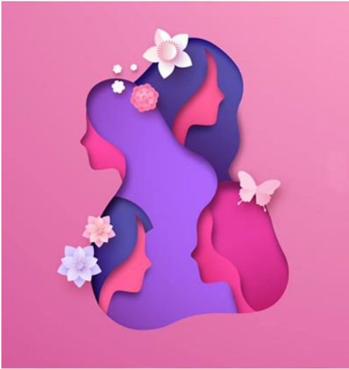
Breast Cancer Awareness Month