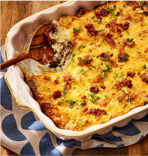
Twice-Baked Potatoes Casserole