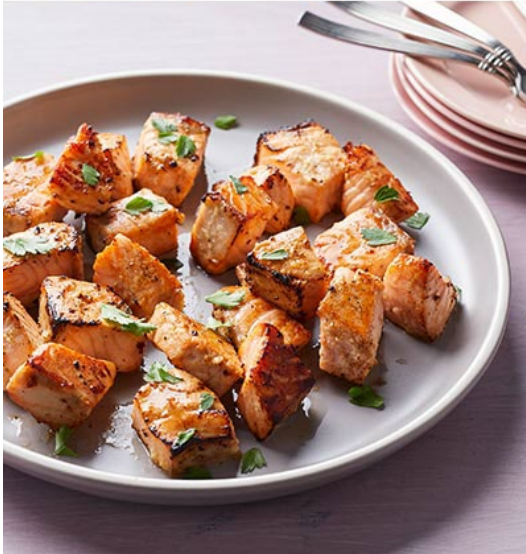
Garlic-Butter Salmon Bites