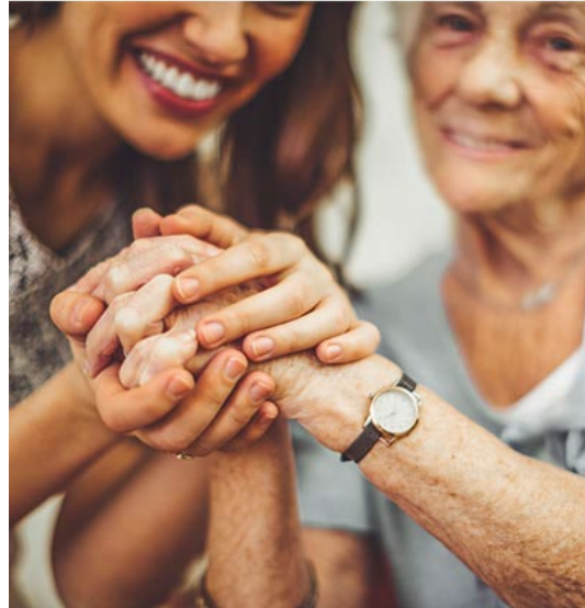
Alzheimer's Awareness Month